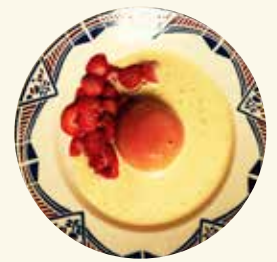
A dreamy summer peach dessert at Le Saint Eutrope in Clermont-Ferrand