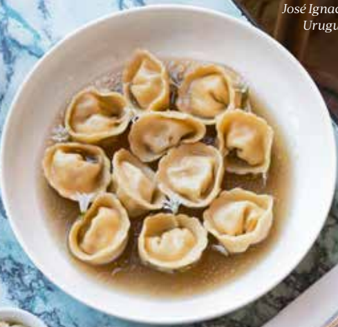
Pasta at Salón No. 3, José Ignacio, Uruguay