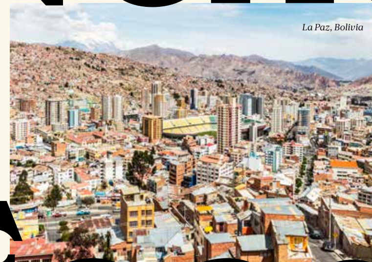
La Paz, Bolivia