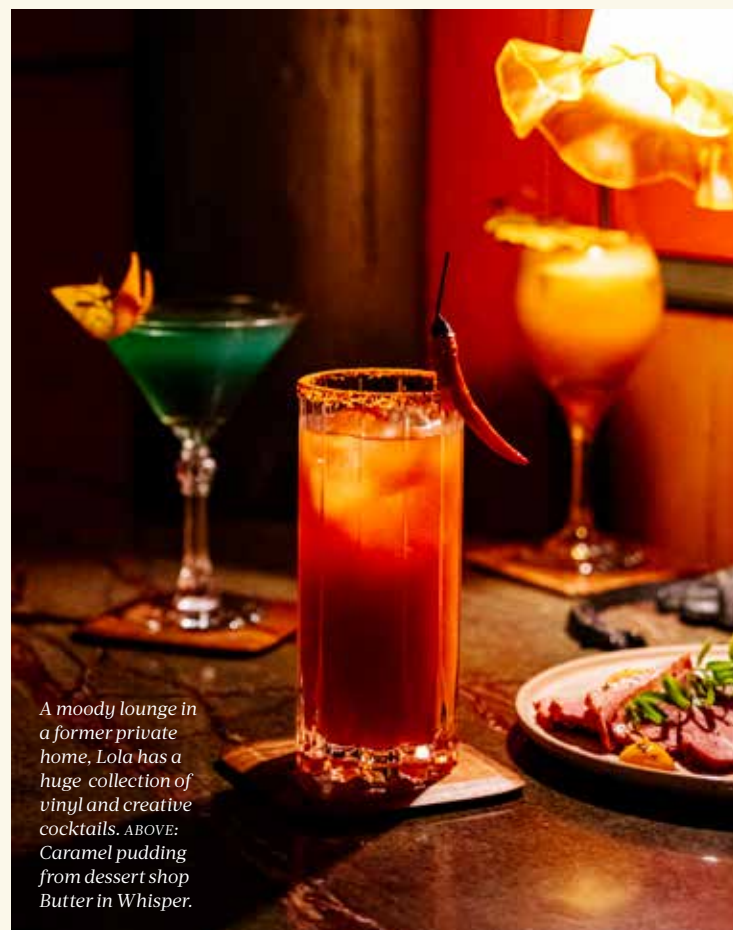
A moody lounge in a former private home, Lola has a huge collection of vinyl and creative cocktails. ABOVE: Caramel pudding from dessert shop Butter in Whisper.

And while Taiwan is known for its rolling fields of oolong tea, for locals in Tainan, coffee is more often than not the beverage of choice. Gan Dan Cafe (No. 13, Lane 4, Section 2, Minquan Road) is particularly lovely, a cluttered yet charming shop in an alley with house-roasted coffee. In a nod to Tainan's tropical climate and abundance of fruit, Butter in Whisper (No. 65, Lane 451, Gongyuan Road), which opened last April, serves refreshing iced coffees flavored with guava and feathery chiffon cakes with Taiwanese Aiwon mangoes. Both morning birds and night owls will adore Swallow (No. 27, Chongan St.); here, they offer single-origin coffee in the morning and transition into a cocktail bar at night, where drinks are garnished with touches like indigenous Taiwanese peppercorns and black sesame. ●