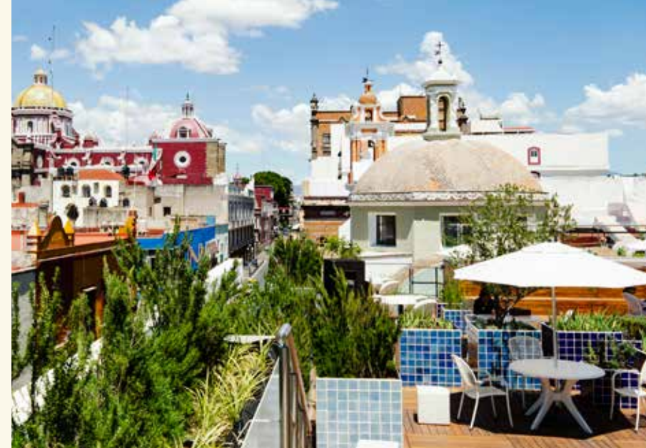
ABOVE: The rooftop café of art museum Museo Amparo affords a top-notch view of the many Baroque buildings and churches in Puebla.