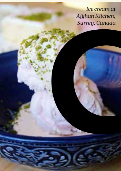
Ice cream at Afghan Kitchen, Surrey, Canada