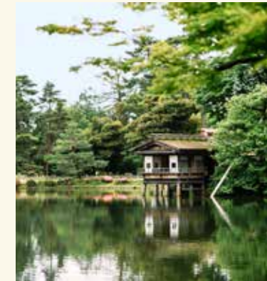
CLOCKWISE FROM LEFT: Chef Ponta Okagawa plates up at the funky Plat Home; Kenrokuen Garden is considered one of Japan's best; Omicho Market is a good spot for chawanmushi (savory egg custard).