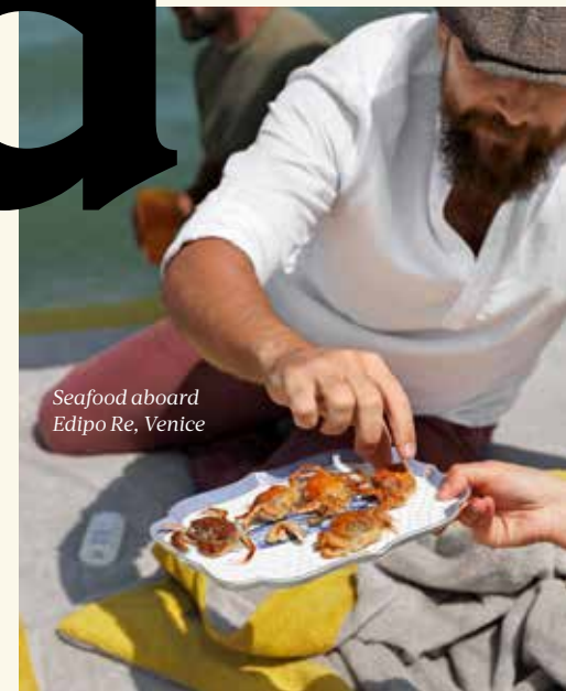
Seafood aboard Edipo Re, Venice

We sent nine writers to scour the world for the best emerging cities for food lovers . Here are the seven big cities and five smaller locales that wowed them (and us!). For the results of our Global Tastemakers survey, where readers voted for their favorite food destinations , see p. 77.