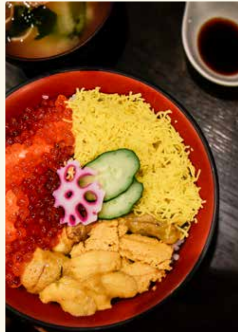
The historic Omicho Market (LEFT) is the place to sample the freshest seafood at the myriad food stalls and restaurants serving dishes such as kaisendon (ABOVE), a bowl of rice topped with a variety of sashimi.