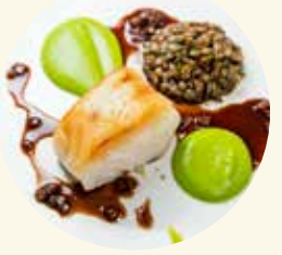
Cod with pea puree, Puy lentils, and red wine sauce at The Little Fish Market in Brighton