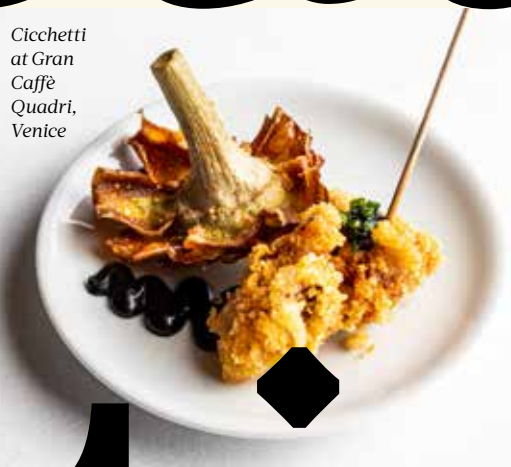
Cicchetti at Gran Caffè Quadri, Venice