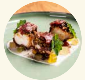
Chef Moreno Cedroni's seaside Clandestino restaurant in Portonovo