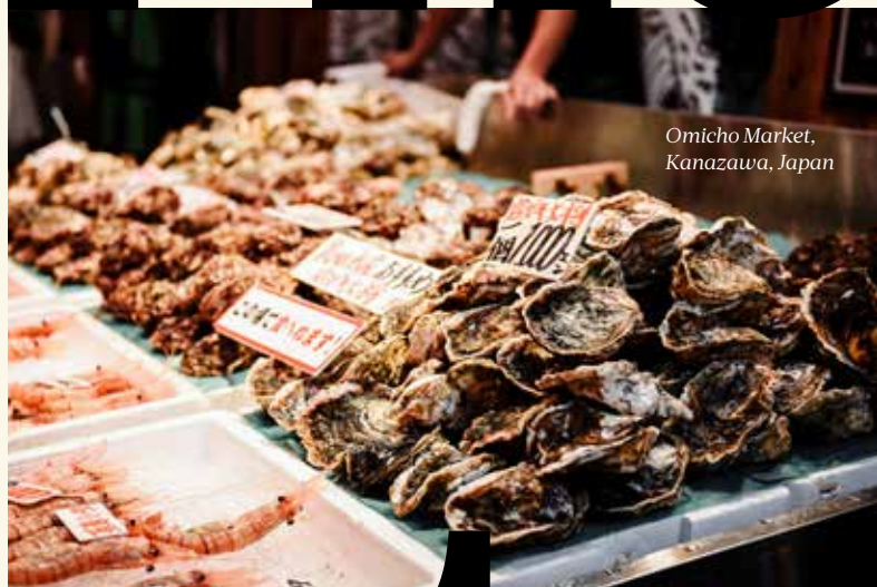
Omicho Market, Kanazawa, Japan