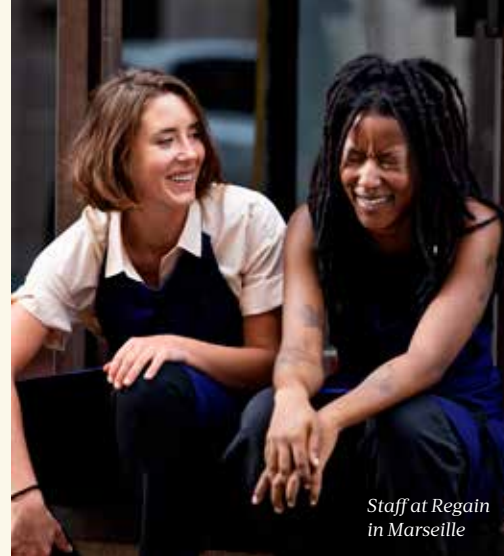
Staff at Regain in Marseille