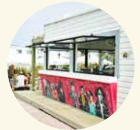
Breezy bars and chic cafés dot the village resort town of José Ignacio.