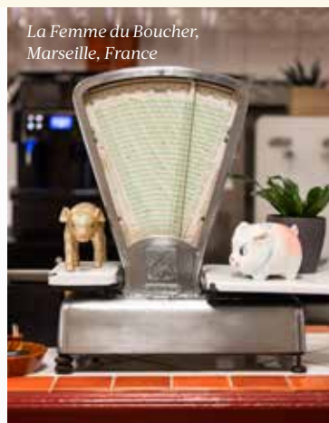
La Femme du Boucher, Marseille, France