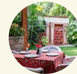
The charming grounds and garden at San Sebastián's Jardín Nebulosa